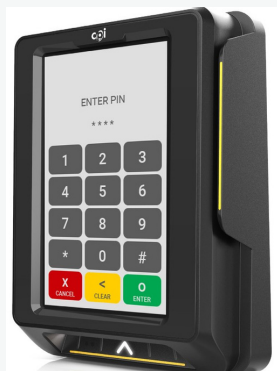
CPI Alio Pro

New Pin on glass technology Available as a contactless only unit Certified for UK and European deployments Onboard payment application Suitable for outdoor deployment PCI PTS V5 SDK available for integration