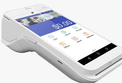
PAX - A920