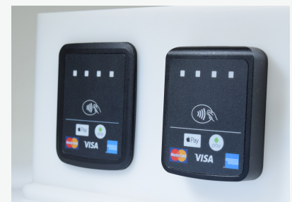
On Track Innovation - Uno-6