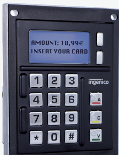
Ingenico iSelf Series

Deployable now for your project and payment requirements, supported subject to device, in UK, Europe, USA and Canada.