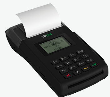
BBPOS - Wisepad 2 Plus