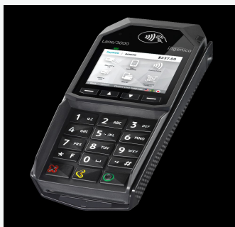
Ingenico Lane 3000