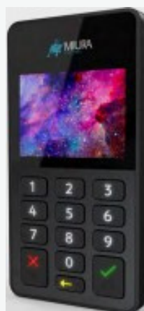
Miura Systems - M020