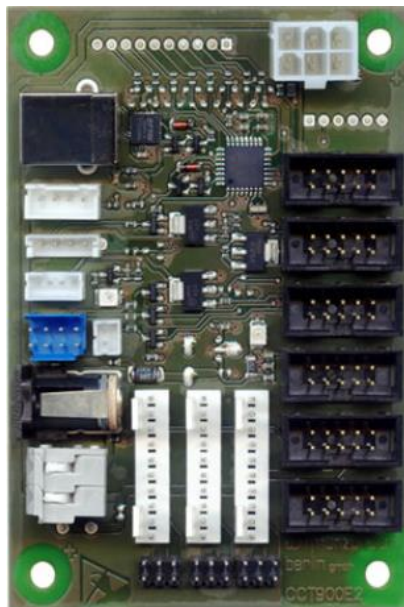
CCT900 shown above