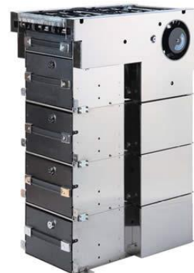
Bank note dispenser