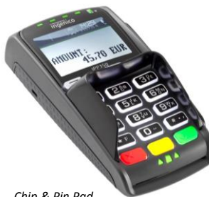
Chip & Pin Pad