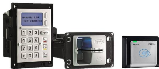
Unattended iSelf Series solution

The Hemisphere West Europe As-a-Service Programme, powered by Econocom